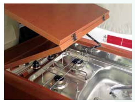
Figure 8: Stowed gas appliance

When installing the appliance locate it such that: