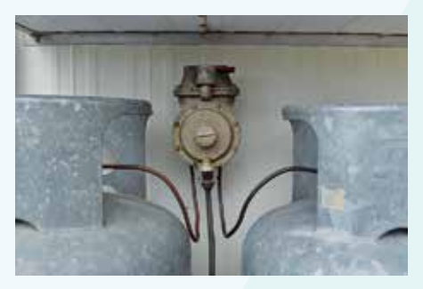
Figure 6: This is an example of a non-compliant installation. Liquid gas can not drain back into the cylinder due to the position of the gas pipes.

Always use cylinder regulators with overpressure protection so downstream pressures will not exceed 14 kPa.