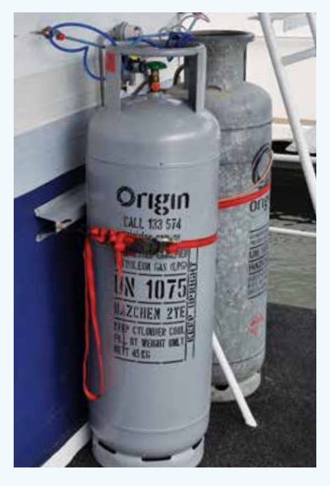
Figure 1: Cylinder restraint