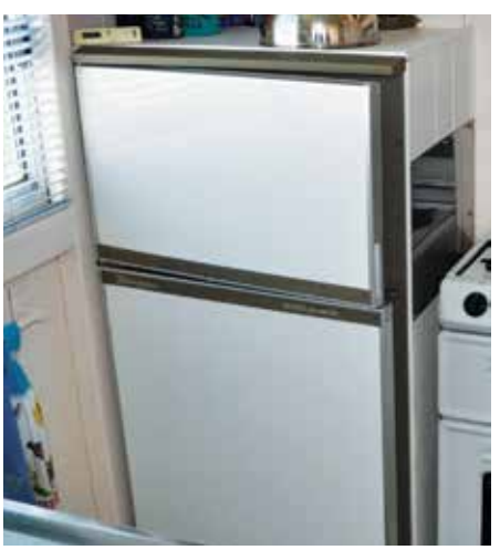
Figure 13: LPG refrigerator installed in a recess

A wall vent measuring a minimum free area of 500mm<sup>2</sup> shall be provided at the bottom level of the refrigerator compartment so that any leaked gas can escape to the outside.