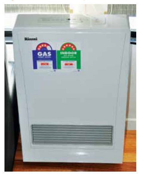
Figure 12: Room-sealed space heater

Permanently fitted space heaters on boats shall be of a room-sealed type.