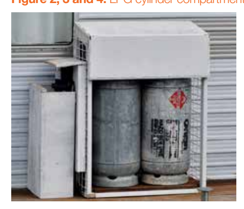
Figure 2, 3 and 4: LPG cylinder compartments and lockers