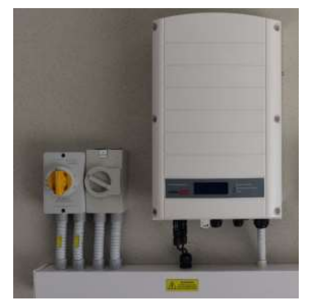
Figure 2: A wall-mounted DC and AC isolator installed adjacent to the inverter

A wall-mounted DC isolator is usually located adjacent to the inverter (see figure 2). In an increasing number of inverter products, this type of DC isolator is integrated into the inverter itself. It allows isolation of the inverter for servicing or replacement without the need to access the roof.