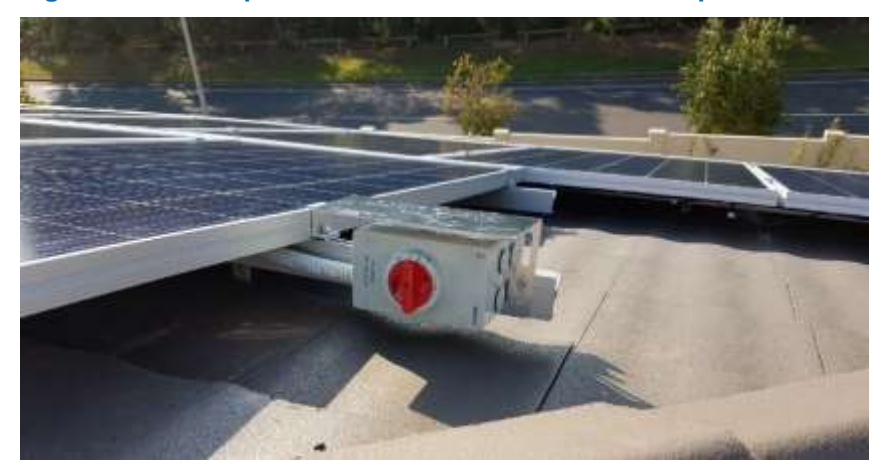
Figure 3: A rooftop DC isolator installed next to solar panels with shroud (protective cover)

However, even if the DC isolator at the inverter is switched off, there is still a live voltage at the solar panels and in the cable that runs between those panels to the isolator at the inverter. A rooftop DC isolator is located adjacent to solar panels as an additional safety mechanism (see figure 3). Manually operated, the switch shuts off DC power flowing between the solar panels and the inverter.