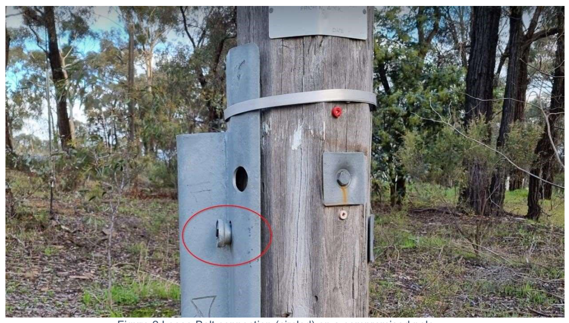
Figure 2 Loose Bolt connection (circled) on a compromised pole Note: outer fibres compress inwards – reducing the effectiveness and strength of the pole / reinforcement connection